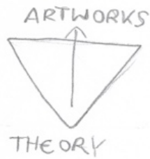
Figure 1: Artistic Research Methodologies. Bettina Schülke